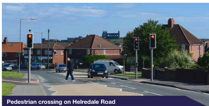
Pedestrian crossing on Helredale Road