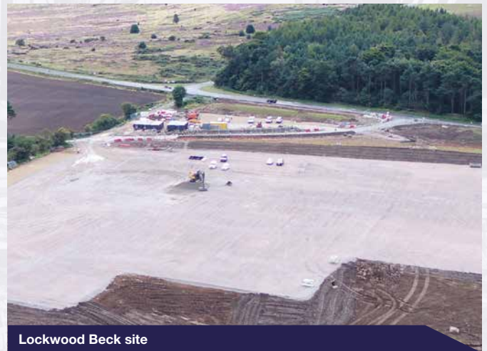
Lockwood Beck site

Work has started at the Wilton International site, the northern end of the MTS, and during 2018 will involve the construction of a below ground portal from which a TBM will be launched.