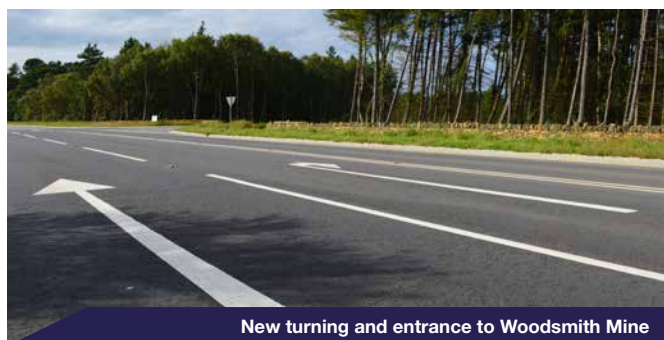
New turning and entrance to Woodsmith Mine