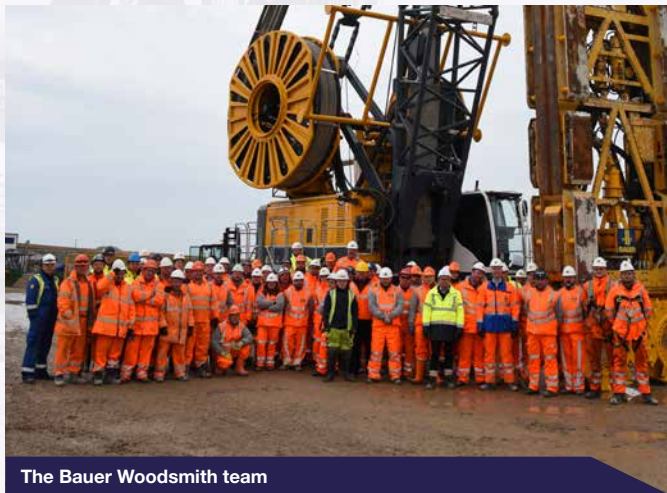
The Bauer Woodsmith team

D-walling and the excavation down to -120 metres will continue throughout most of 2018.